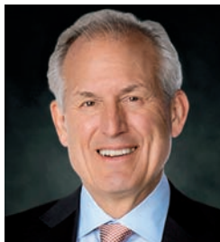
W. JAMES McNERNEY, JR.

in lots of different countries in the world, we have kept our jobs and our technology here, in part because of this arrangement here. I’m beginning to question the strategy of making and designing everything in the United States, ... if there’s not an Export-Import Bank. We’re actively considering now moving key pieces of our company to other countries.”